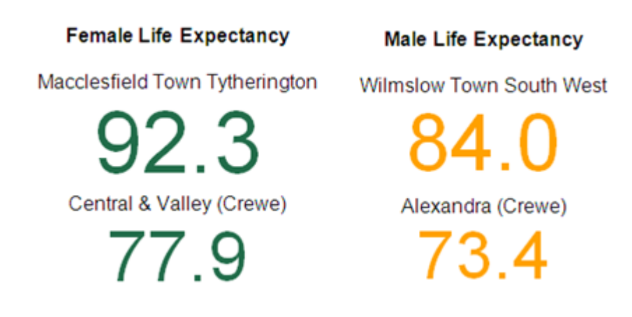
Figure 4: Male and Female Life Expectancy at birth<sup>19</sup>

Smoking rates are generally relatively low. An estimated 16.6% of the adult population are current smokers, which is lower than the North West (23.6%) and England (22.2%). Rates vary from 7.9% in Adlington & Prestbury to 34.3% in St Barnabas<sup>20</sup>.